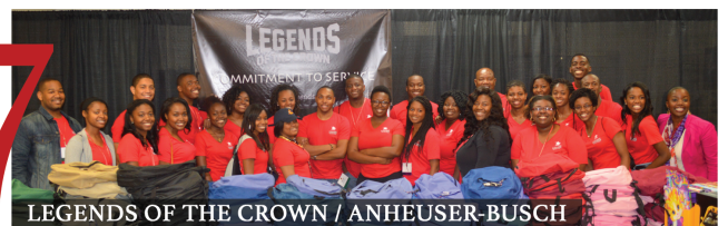
LEGENDS OF THE CROWN / ANHEUSER-BUSCH