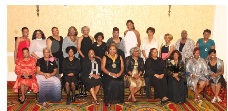
Urban League Guild of Metropolitan St. Louis, Inc.

Urban League Guild of Metropolitan St. Louis, Inc. was awarded 1st place in Community Service and 2nd place in Fundraising from the National Urban League Council of Guilds at the 2015 National Urban League Convention in Ft. Lauderdale, Florida.