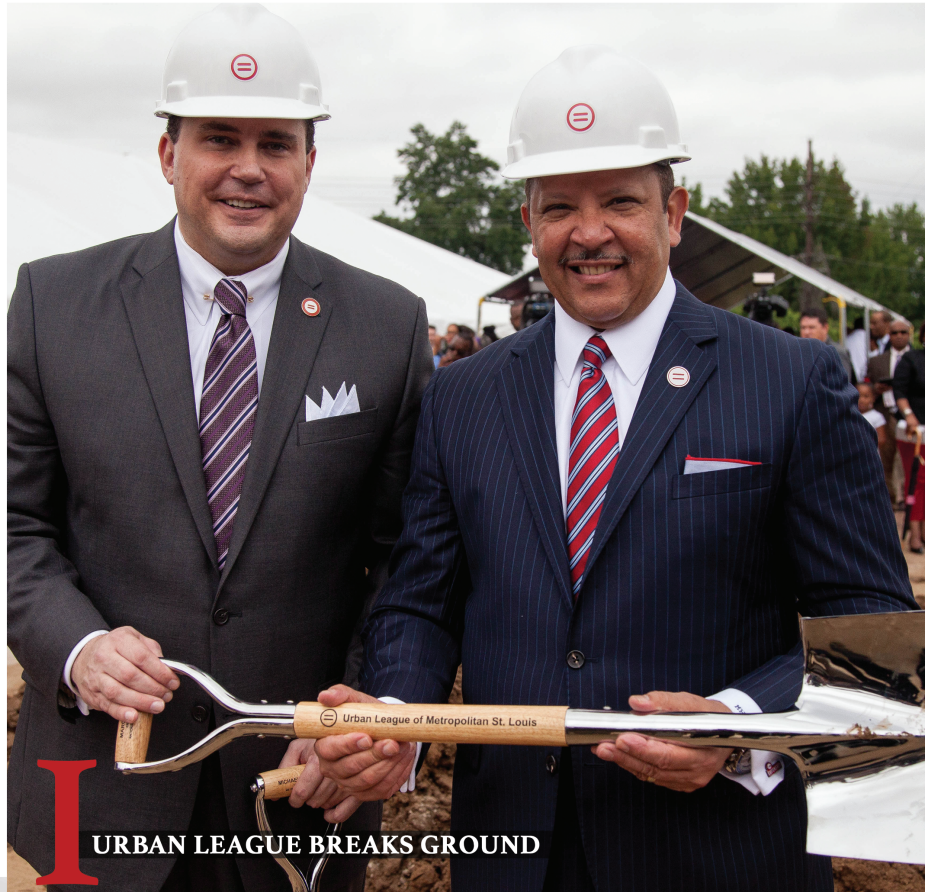
URBAN LEAGUE BREAKS GROUND

The new $3 million Fund, led by the Citi Foundation and America's Promise Alliance, supports innovative city programs that prepare low-income youth for future success.