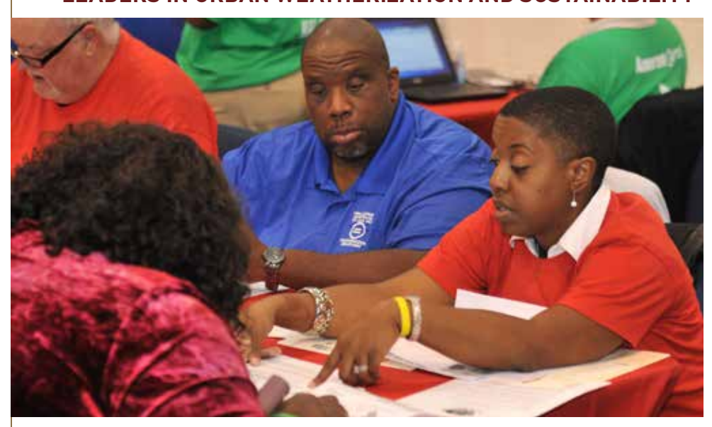
The 2nd Annual AmerenMO/Heat-Up St. Louis Winterizing Forum included the dedicated staff from the Urban League of Metropolitan St. Louis, Inc., who joined 5 other City/County social service agencies to help educate, and reduce electric bills each October.

Urban League Weatherization Assistance Programs enable low-income families to permanently reduce their energy bills by making their homes more energy-efficient. Our weatherization team consists of highly trained and professionally-certified personnel using advanced energy audits and sophisticated diagnostic equipment to identify cost-effective measures. Measures may include caulking, installing insulation, furnace repair or replacement, and in some cases, window and door repairs or replacement with the goal of reducing home energy costs, improving its comfort and ensuring the health and safety of the home by improving its air quality.