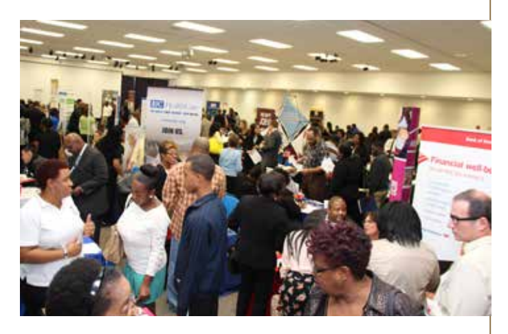
The Urban League hosted its largest job fair in agency history at the St. Louis Community College-Florissant Valley in Ferguson.

In addition to jobs, the fair also provided residents with resource and educational seminars, grociers, toiletries, and recreational activites for youth from 45 social service providers.