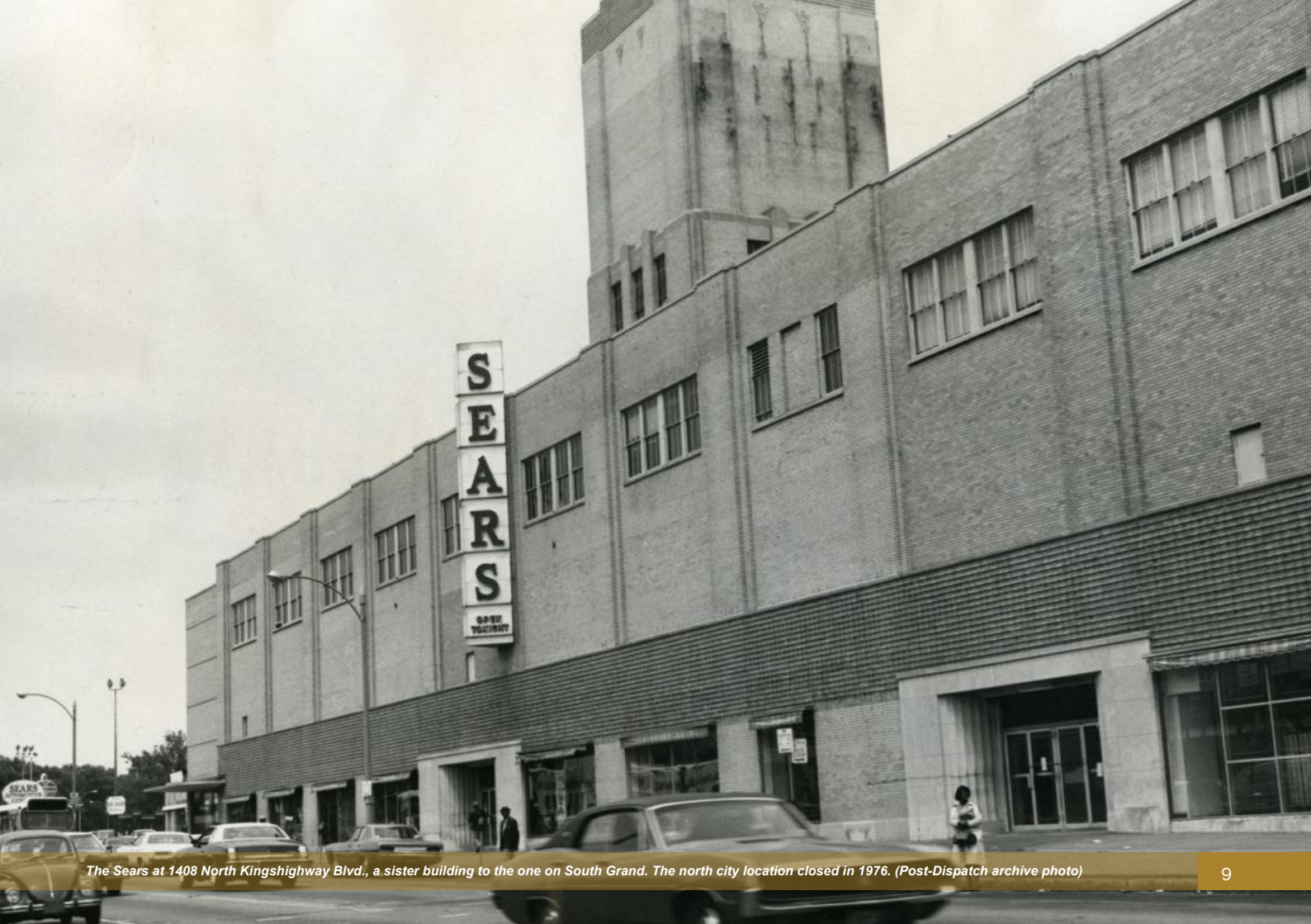
The Sears at 1408 North Kingshighway Blvd., a sister building to the one on South Grand. The north city location closed in 1976.